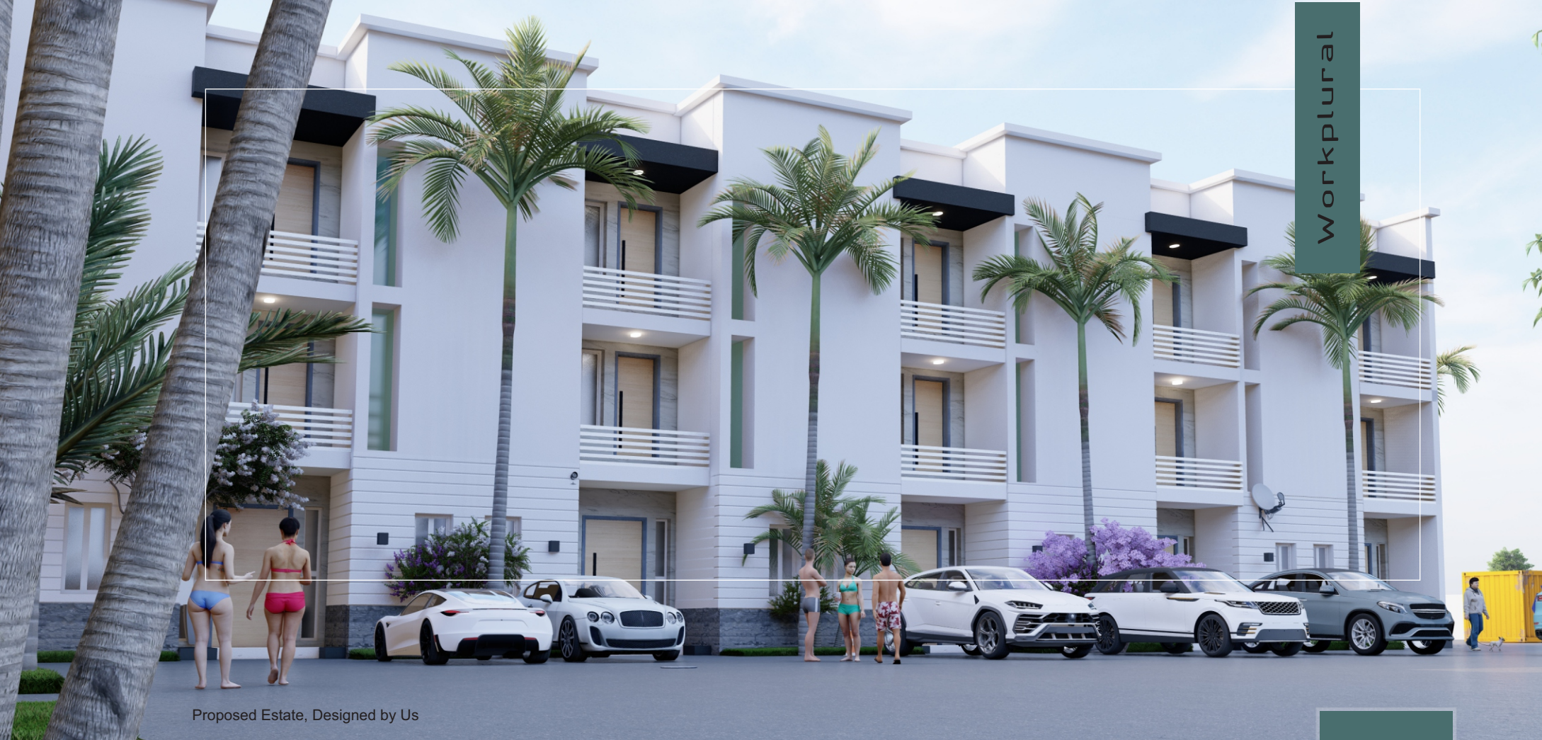
Proposed Estate, Designed by Us

ITS EASY TO PAMPER YOURSELF IN THIS HOME IS FLANKED BY SPIDER-BEAM CEILING AND NICHE FOR DISPLAYING SMALL ART PIECES OR COLLECTABLES.