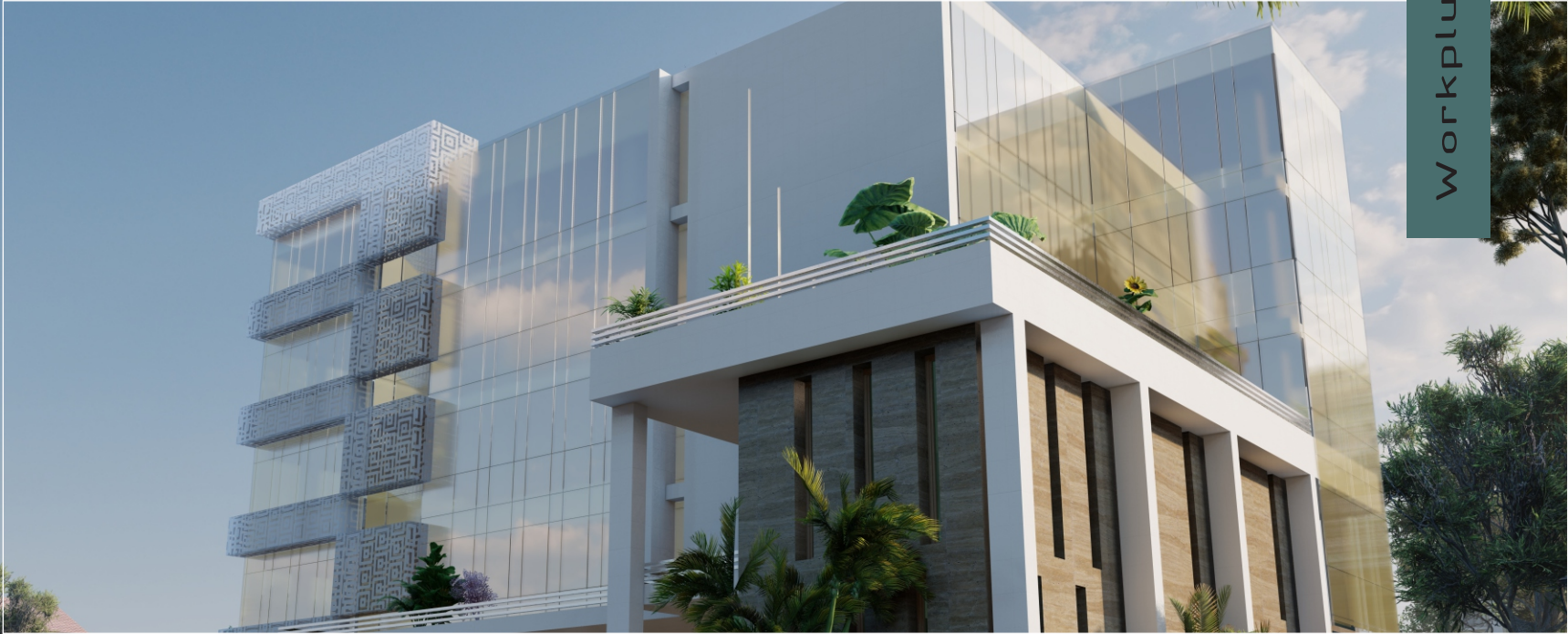
Proposed Commercial Designed

THIS BEAUTIFUL COMMERCIAL/MULTI-PURPOSE BUILDING TELL A STORY AND GIVE THE PSYCHOLOGY OF BUILDING A CHANCE TO PLAY IT ROLE FULLY AND YOU NEED TO KNOW THIS.