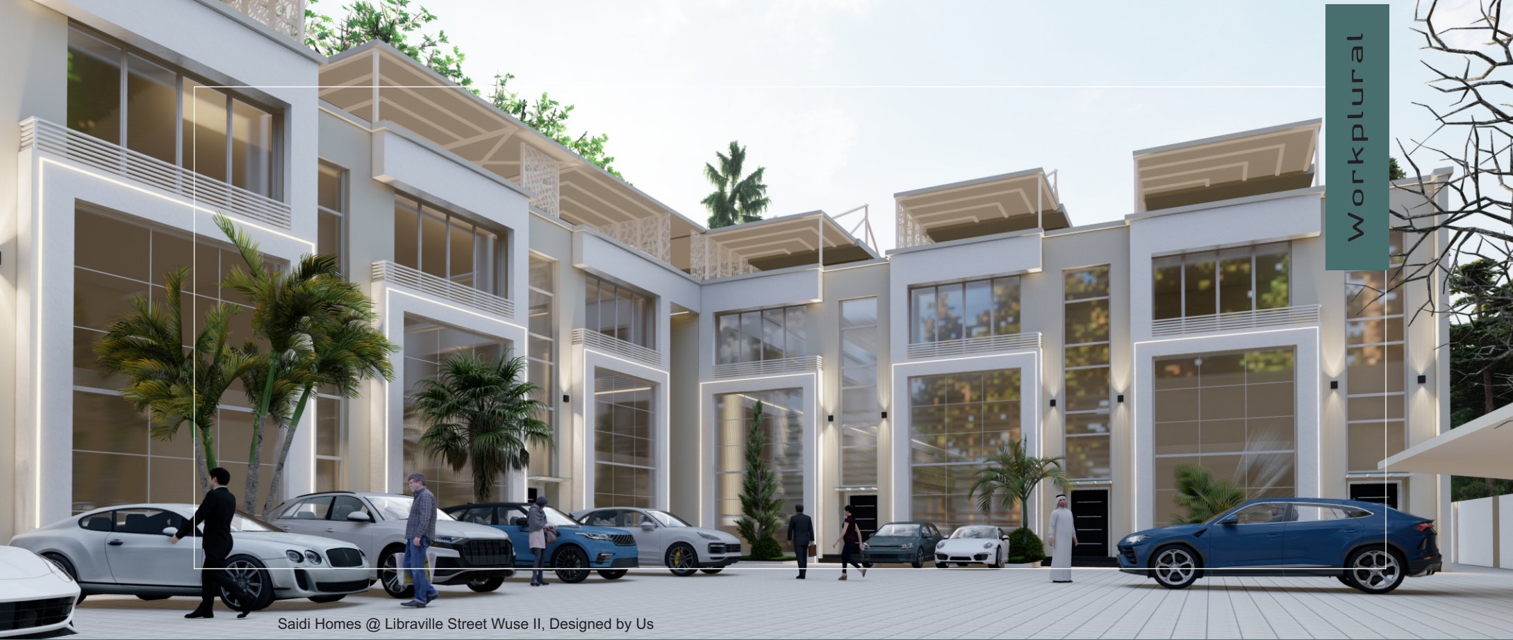
Saidi Homes @ Libraville Street Wuse II, Designed by Us