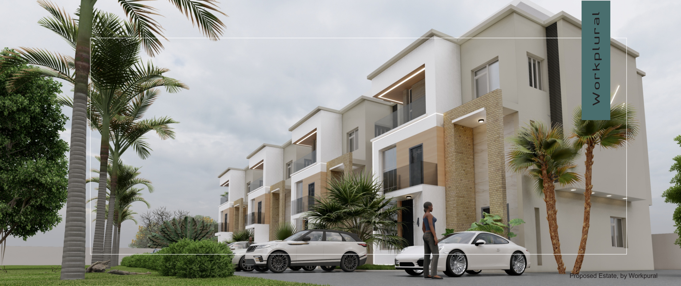
Proposed Estate, by Workplural

DESIGN FOR A COASTLINE, THIS SPLIT LEVEL HOME IS EQUALLY APPROPRIATE AS A YEAR ROUND RESIDENCE OR VACATION RETREAT FOR EMPTY-NESTERS OR SMALL FAMILY. ALSO OUTFITTED FOR GOURMET COOK THAT DECLARERS HOW WELL IT IS