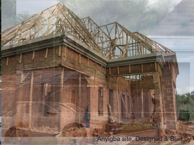
Anyigba site, Designed & Built by Us