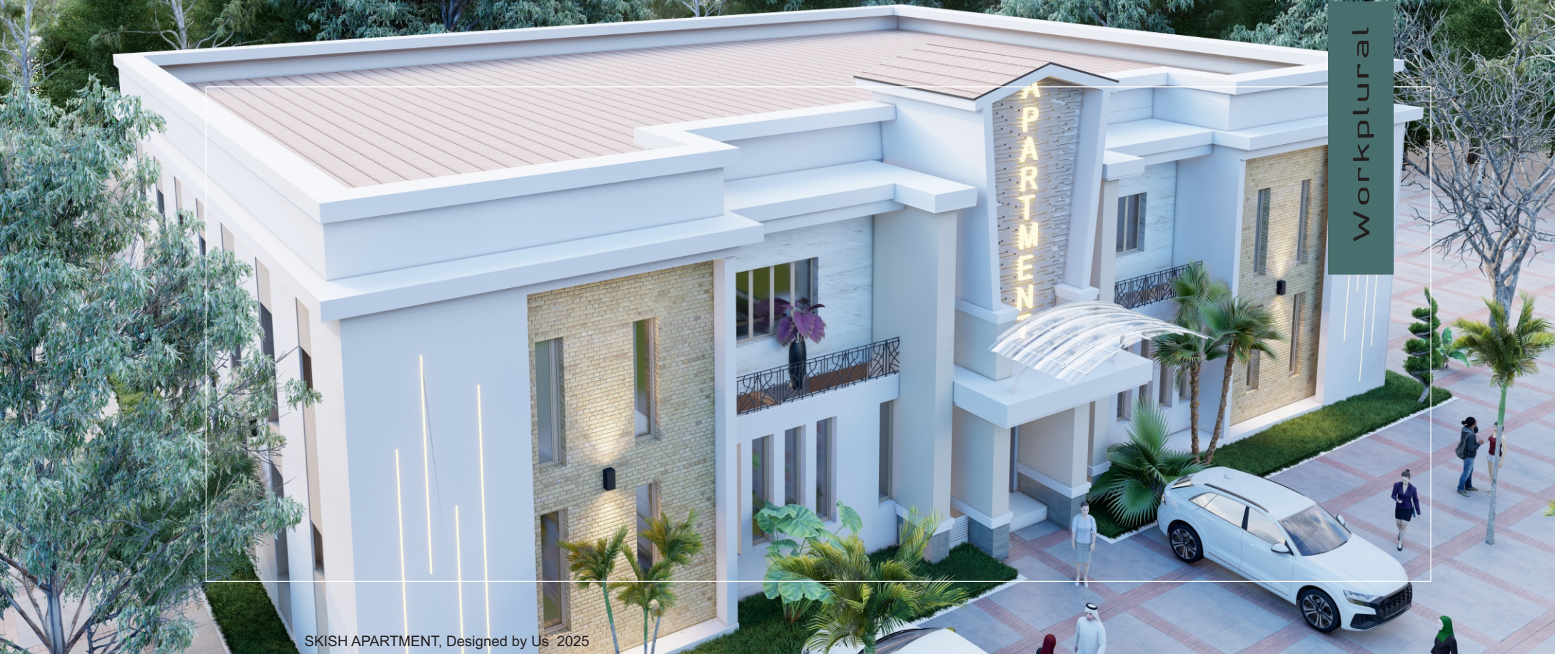
SKISH APARTMENT, Designed by Us 2025

“I WANTED AN APARTMENT-DESIGN THAT WILL CHARM AND ATTRACT TYCOONS. NOT ONLY DID I GOT IT, I AM IMPRESS BY THE SOURING ENTRY-WAY STYLE, WITH STONE AND BRICKS EXTERIOR FOR A BUSY MODERN LIFESTYLE. THIS IS LUXURY”